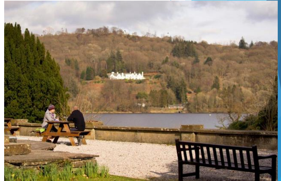
The terrace and view from the main building.