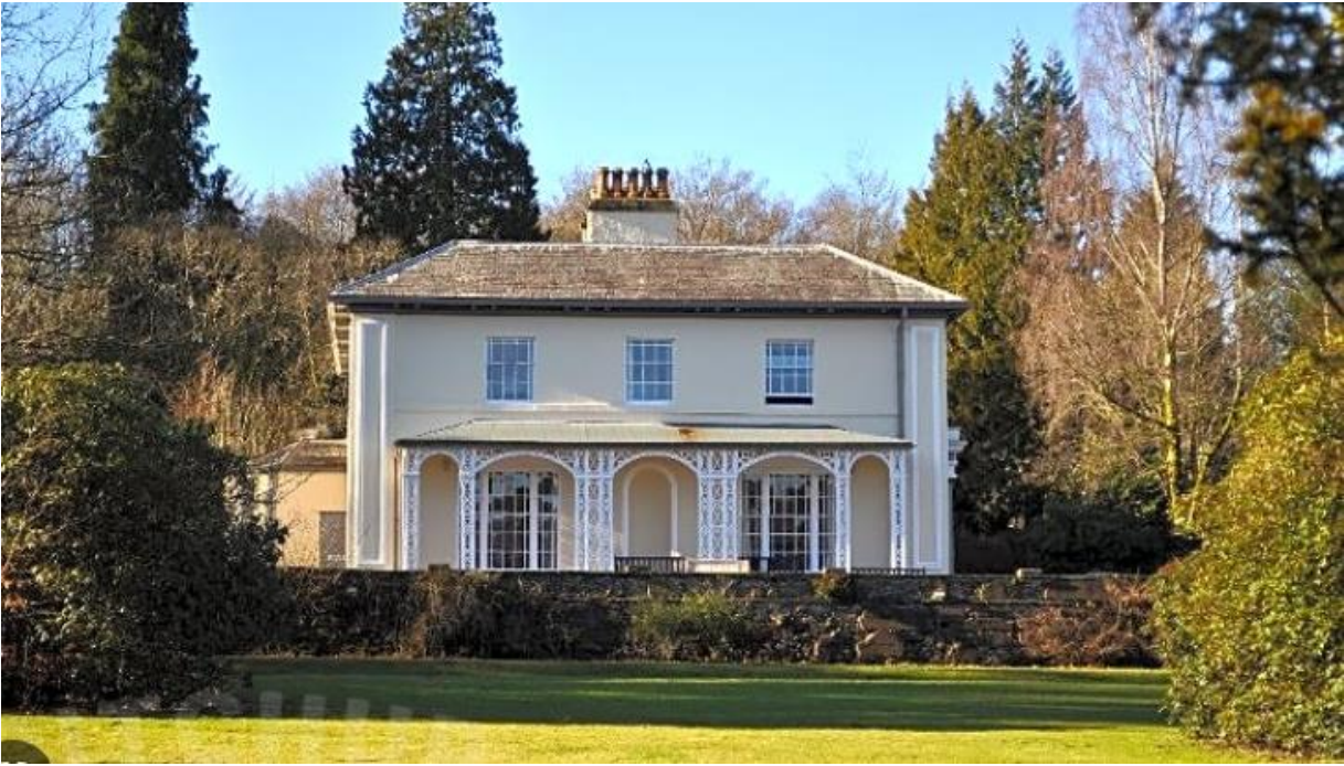
The main building