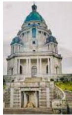
The Ashton Memorial