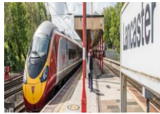
Lancaster Train Station